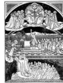
32 nd Sunday in Ordinary Time November 6, 2016

If you or a family member is in the hospital and you would like the priest at Our Lady of the Assumption to contact you, please phone the office at 705 – 741 – 1018.