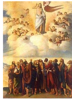
Ascension of the Lord